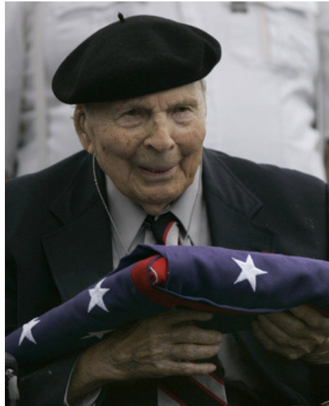
In 2008, World War I veteran Frank Buckles received an American flag on Memorial Day at the National World War I Museum in Kansas City, Mo.

Buckles enlisted in World War I at 16 after lying about his age. He died Sunday on his farm in Charles Town, nearly a month after his 110th birthday. He had devoted the last years of his life to